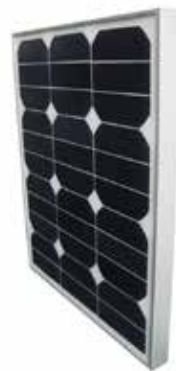
Sun Peak SPR 30