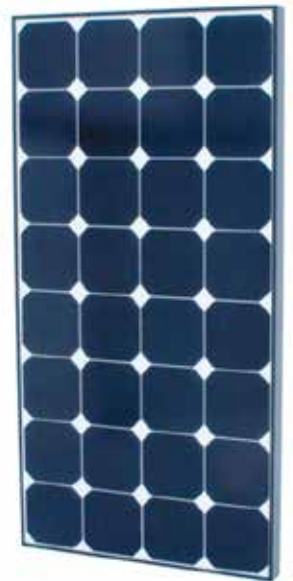
Sun Peak SPR 100